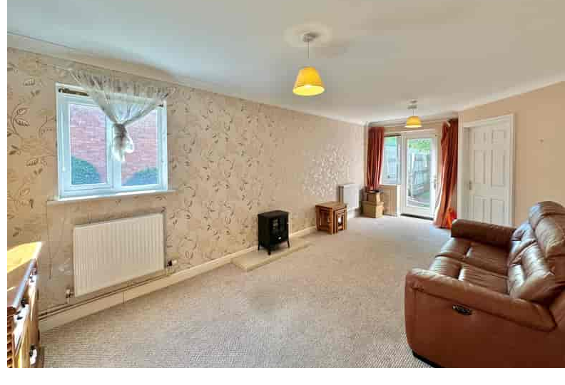
• No onward chain • Ground floor one bedroom apartment • Allocated parking • Walking distance from City centre • Communal garden.