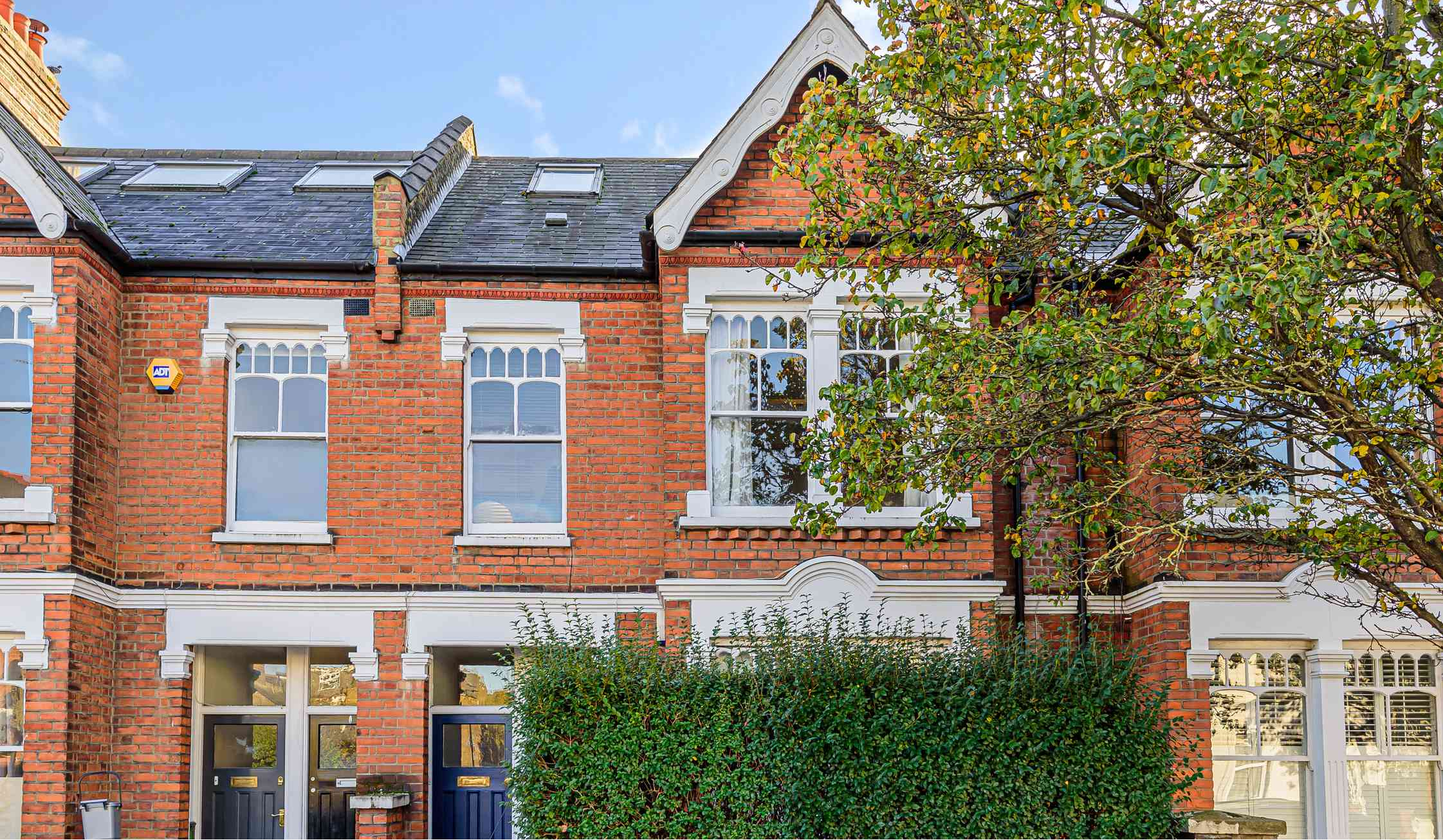
Jeddo Road, London, W12 9EQ