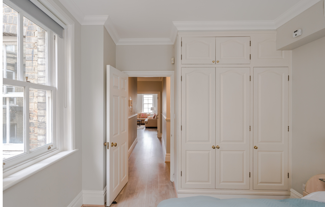
Flat 16, 117 York Place Mansions, Baker Street, Marylebone, London, W1U 6RX £1,390,000 - Leasehold