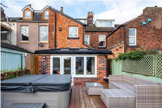
REAR OF THE PROPERTY

OUTHOUSE (10'4 x 5'7) Currently used as a gym with frosted window and power.