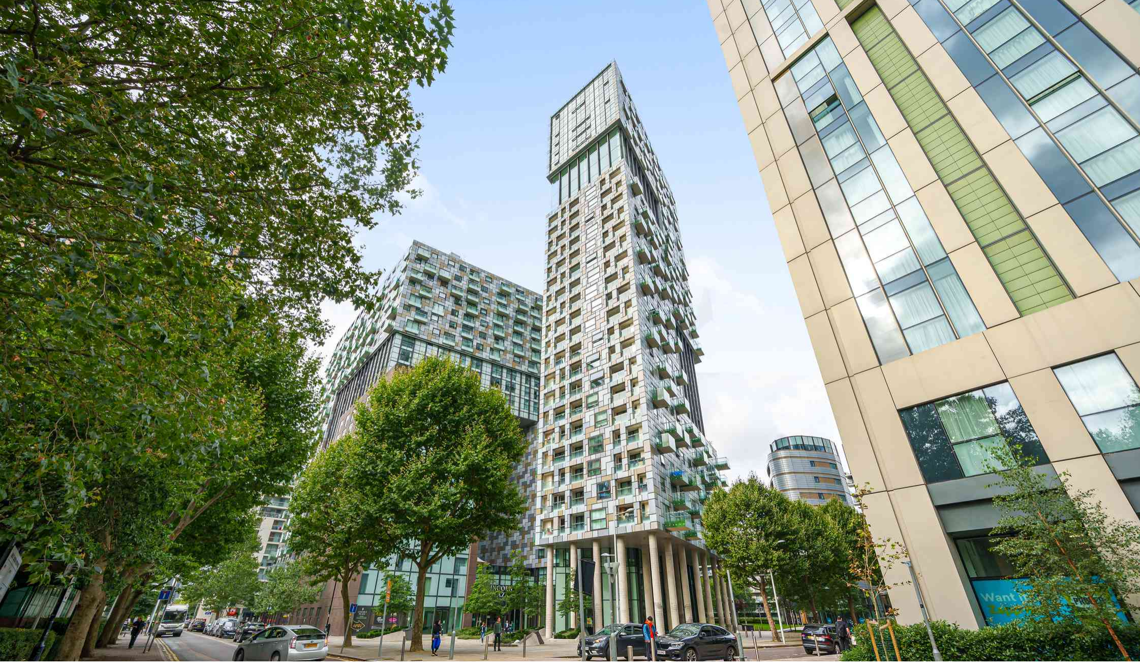
Lincoln Plaza, London, E14 9BN