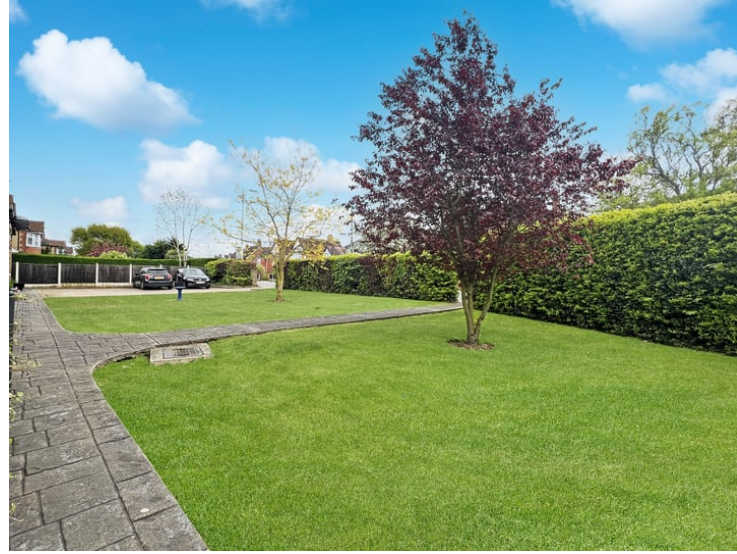
Single Garage & Parking