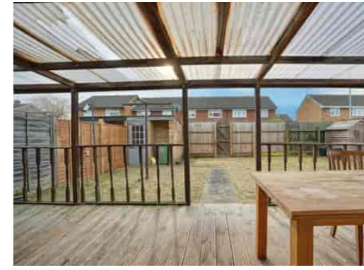
Flaxen Walk, Warboys PE28 2TS