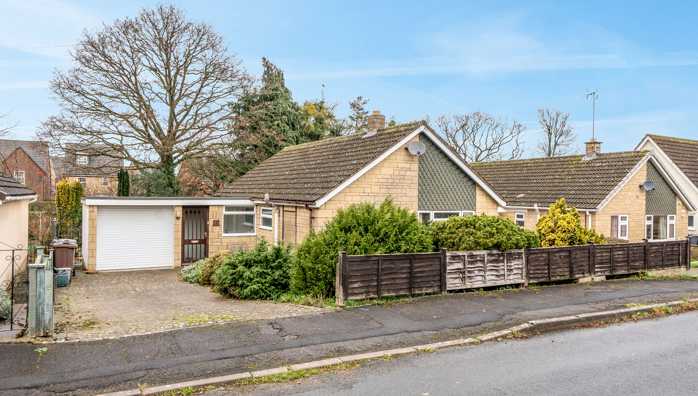
19 Castle Mead, Kings Stanley, Gloucestershire, GL10 3LB £375,000