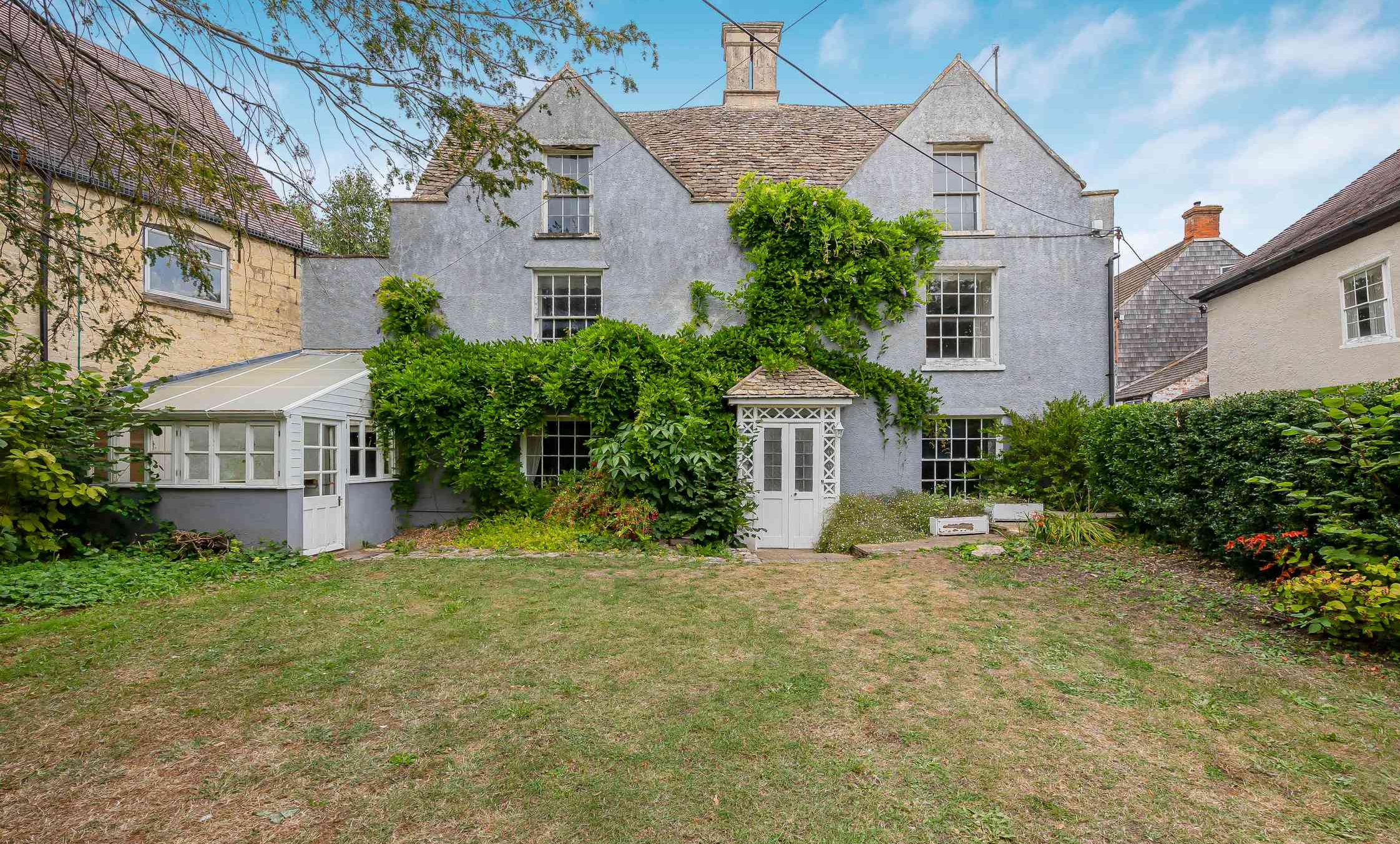
Parkend House, Paganhill, Stroud, Gloucestershire, GL5 4AZ Guide Price £675,000