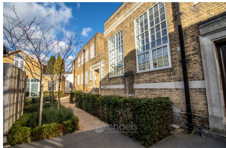
To the front of the property there is a paved patio area, bordered by shrubs with space for garden furniture. Steps to front door.