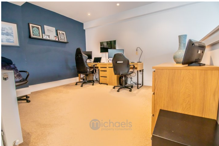
10' 09" x 12' 01" (3.28m x 3.68m) Radiator, access to storage cupboard, access to shower room.