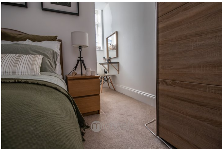
11' 07" x 10' 07" (3.53m x 3.23m) Double glazed window to front aspect, Skylight, radiator.