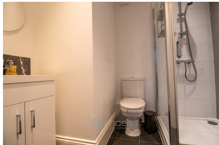
Heated chrome towel rail, low level WC, hand wash basin with vanity underneath, shower cubicle, tiled flooring, part tiled walls, extractor fan.