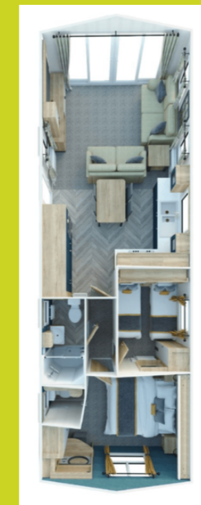
The above floor plans are not to scale and are shown for indication purposes only.