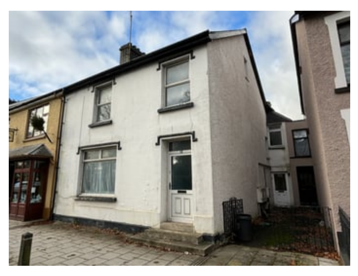
Rear of Property