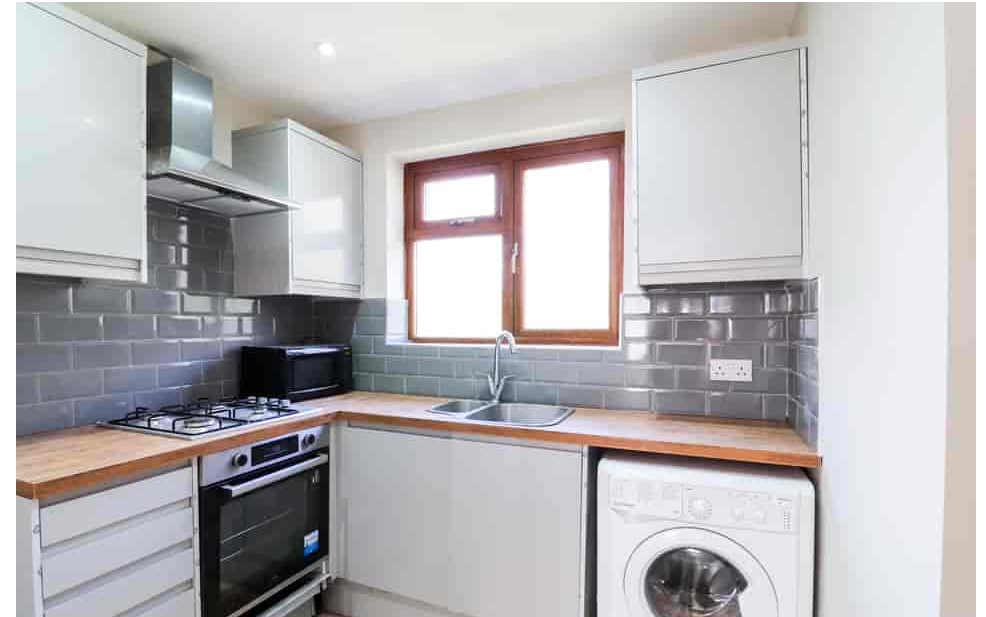
Fulford Drive, Northampton NN2 7NU Guide Price £1,400 pcm