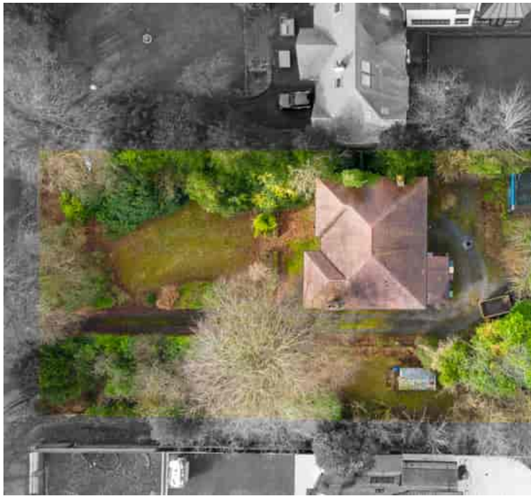
Proposed Images - 48 St Andrews Road