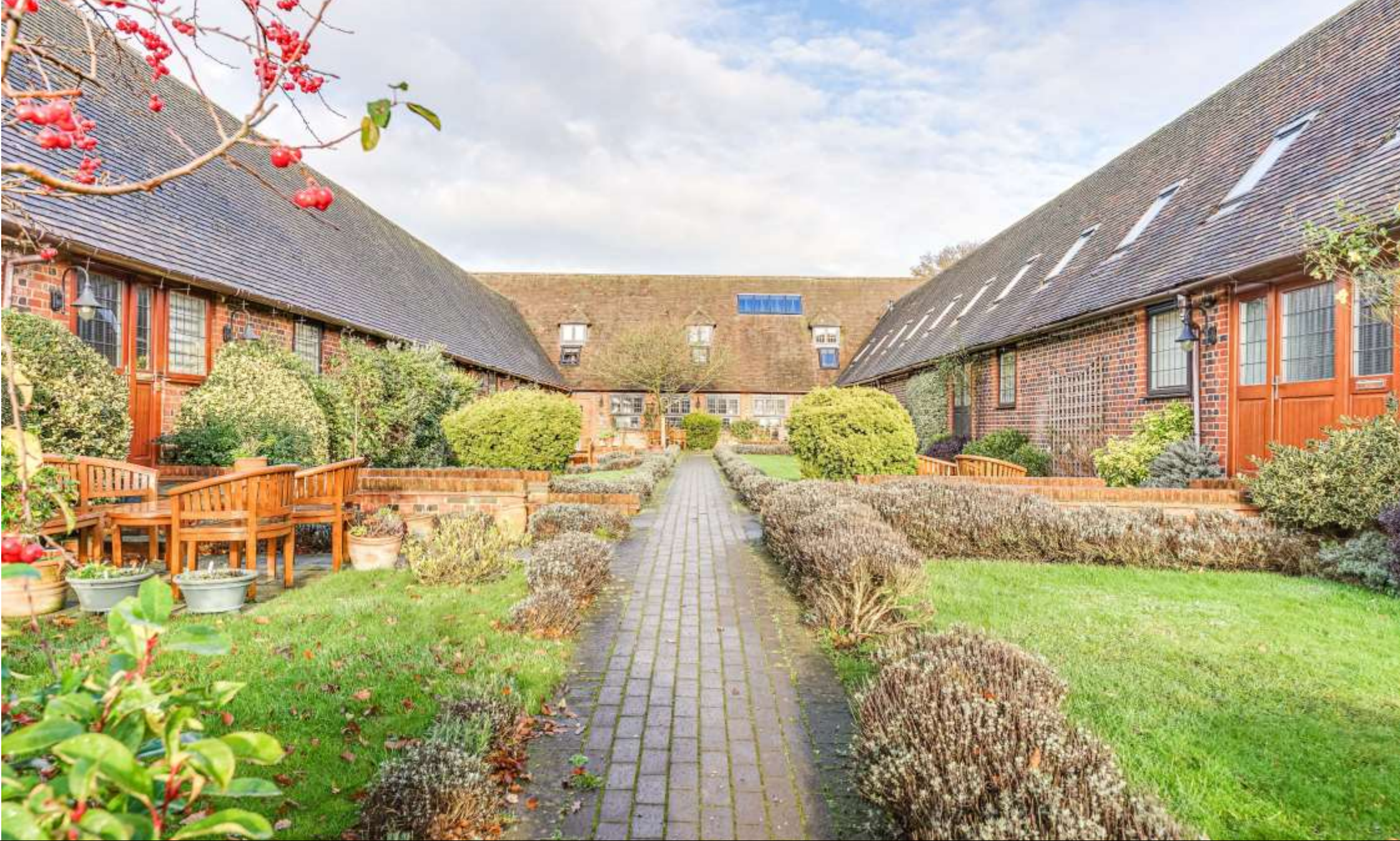
Ladygrove Mews | Preston Hitchin, Hertfordshire | SG4 7SA