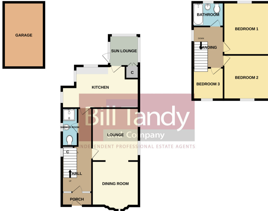
1ST FLOOR 448 sq.ft. (41.6 sq.m.) approx.