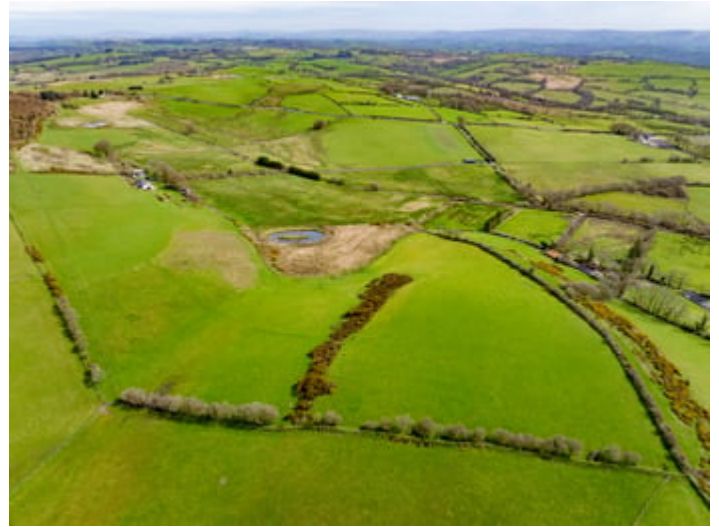
LAND (FIFTH IMAGE)