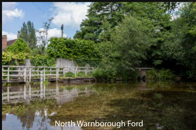
North Warnborough Ford