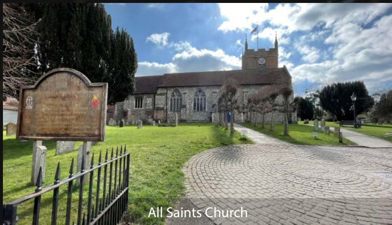
All Saints Church

Road links are excellent with the M3 within 2 miles.