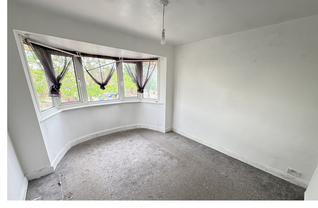
142 Clare Road, Staines-upon-Thames, Surrey TW197EG £315,000 - Leasehold