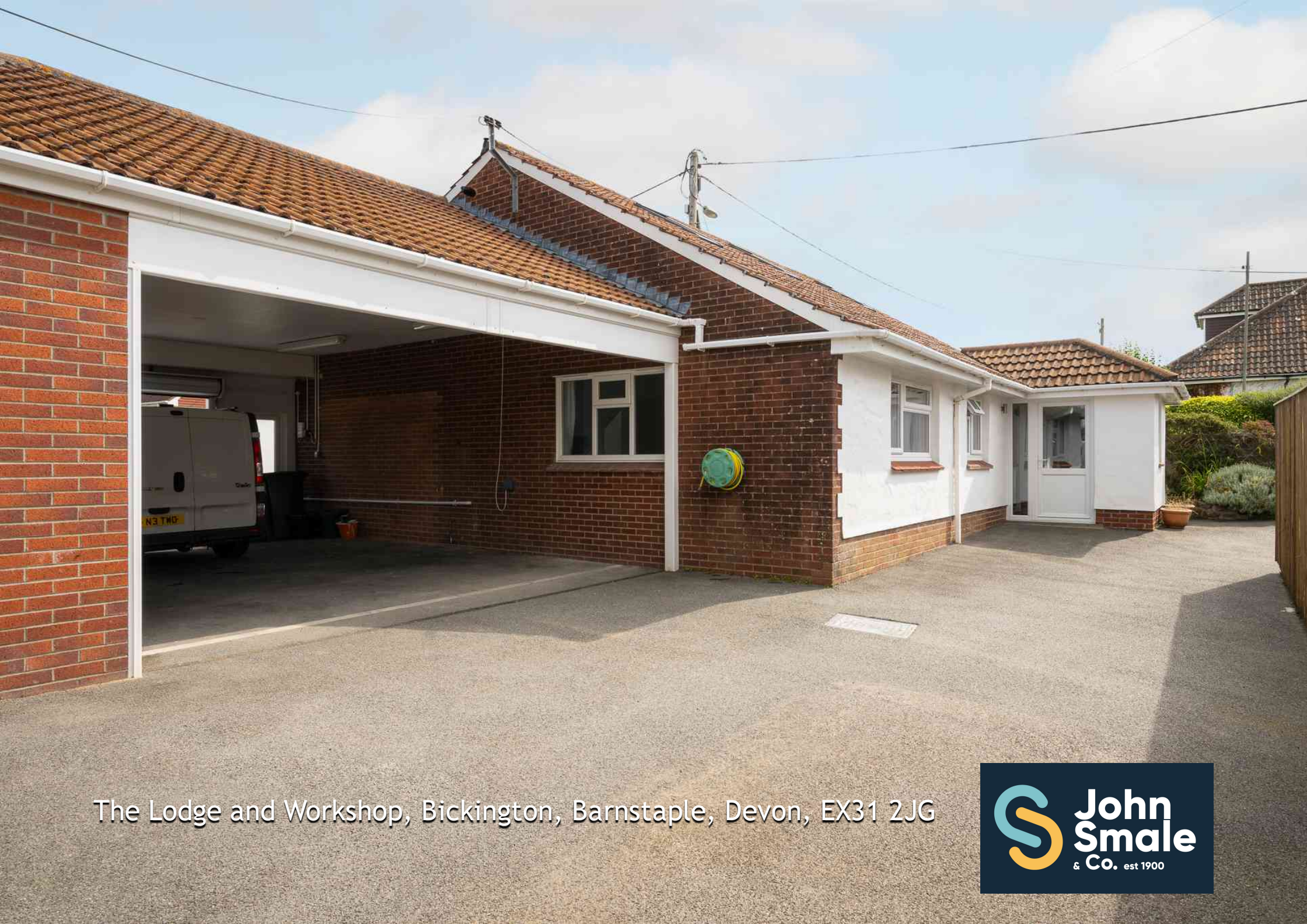
The Lodge and Workshop, Bickington, Barnstaple, Devon, EX31 2JG