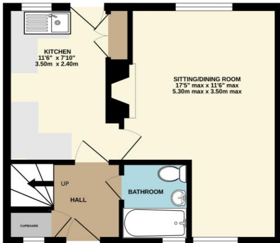
GROUND FLOOR 339 sq.ft. (31.5 sq.m.) approx.