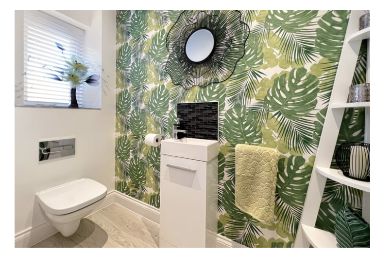
2.21m x 0.99m (7' 3" x 3' 3")