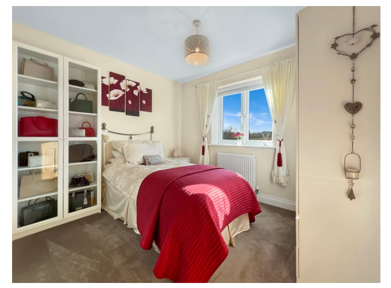
4.57m x 3.45m (15' 0" x 11' 4")