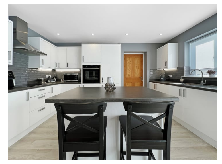
6.77m x 5.18m (22' 3" x 17' 0")