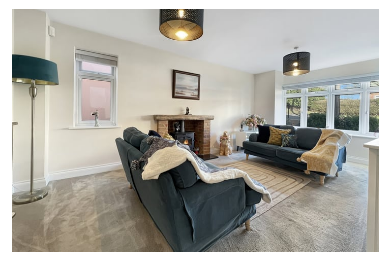
5.78m x 3.32m (19' 0" x 10' 11")