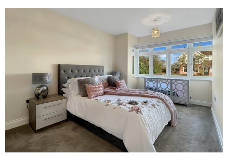
3.12m x 2.66m (10' 3" x 8' 9")