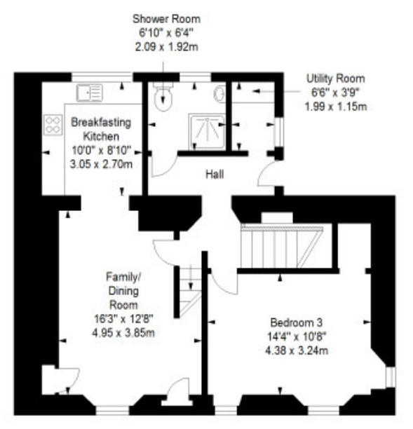
Total area: approx. 169.8 sq. metres (1827.8 sq. feet)