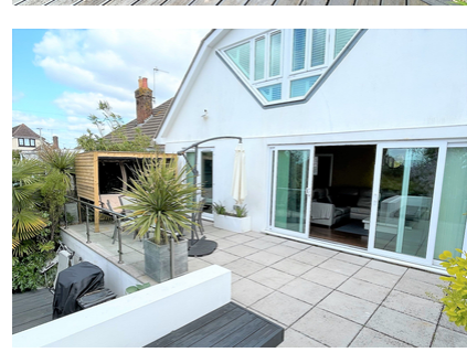
34 Gorsehill Road, Oakdale, Poole, Dorset BH15 3QJ

An exemplary three/four bedroom detached chalet situated in one of Oakdale's most sought after roads. This exceptional home offers over 1200 sq ft of luxurious living throughout and internal viewing is a must to appreciate the stylish and versatile accommodation on offer, which comprises: 19' lounge, contemporary kitchen, dining area, downstairs cloakroom, study/bedroom four and bespoke bathroom. Externally the property boasts a South Westerly aspect garden with lower lawned and decked areas the paved steps lead to a large sun patio with built-in seating area, HOT TUB room and an outbuilding. To the front the driveway provides off road parking. Further features of this ready to move into home include: integrated appliances to kitchen, sky lights, fitted wardrobes, gas central heating and UPVC double glazing. Nearby Schools - St Marys Catholic Primary, Longfleet Primary, Poole High and St Edwards Rc/CoE Secondary.