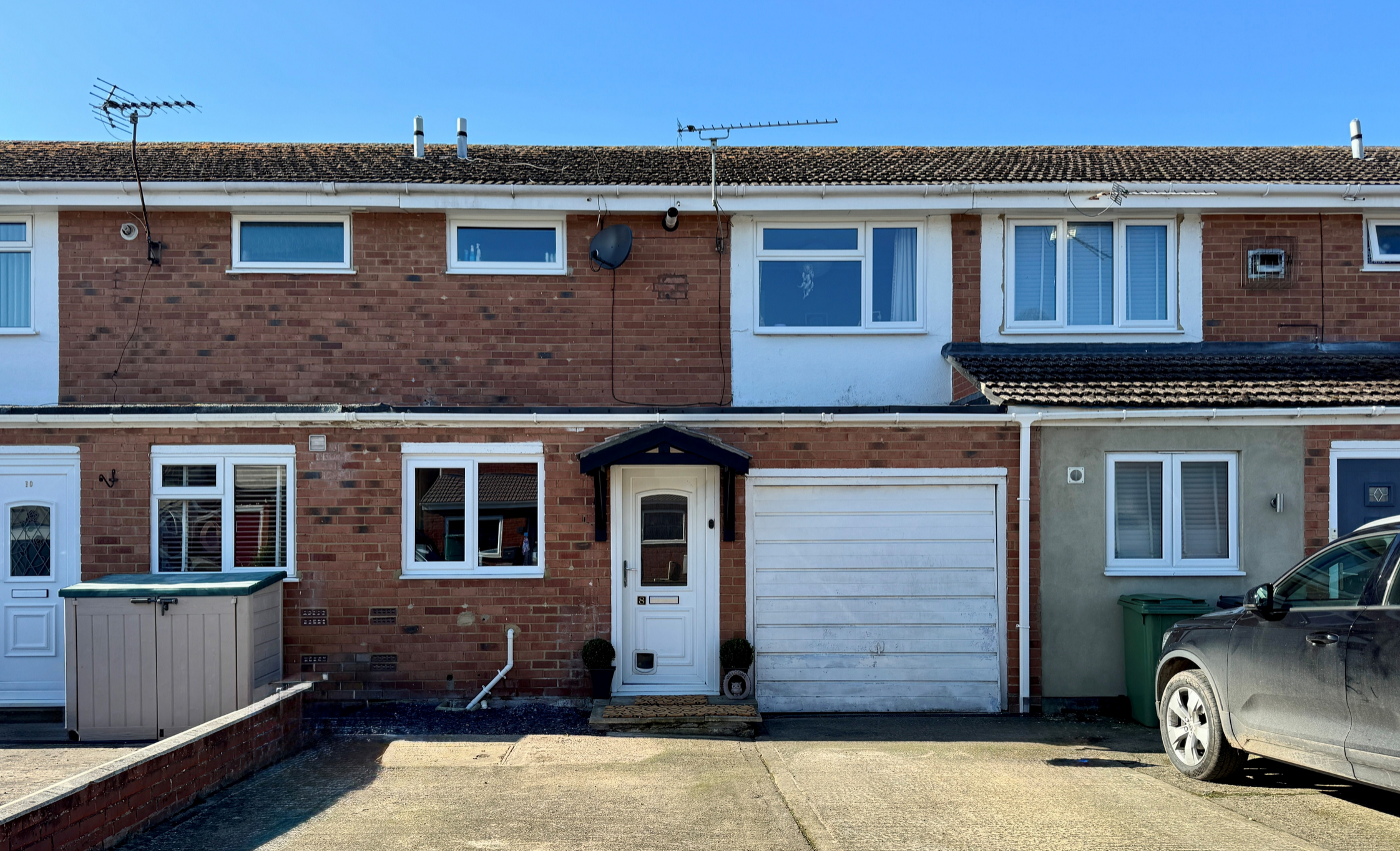
8 Pound Croft, Grove, Wantage, Oxfordshire OX12 0BZ Oxfordshire, £310,000