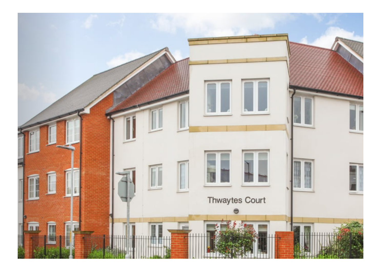
32 Thwaytes Court, Minster Drive, Herne Bay, Kent, CT6 8BF