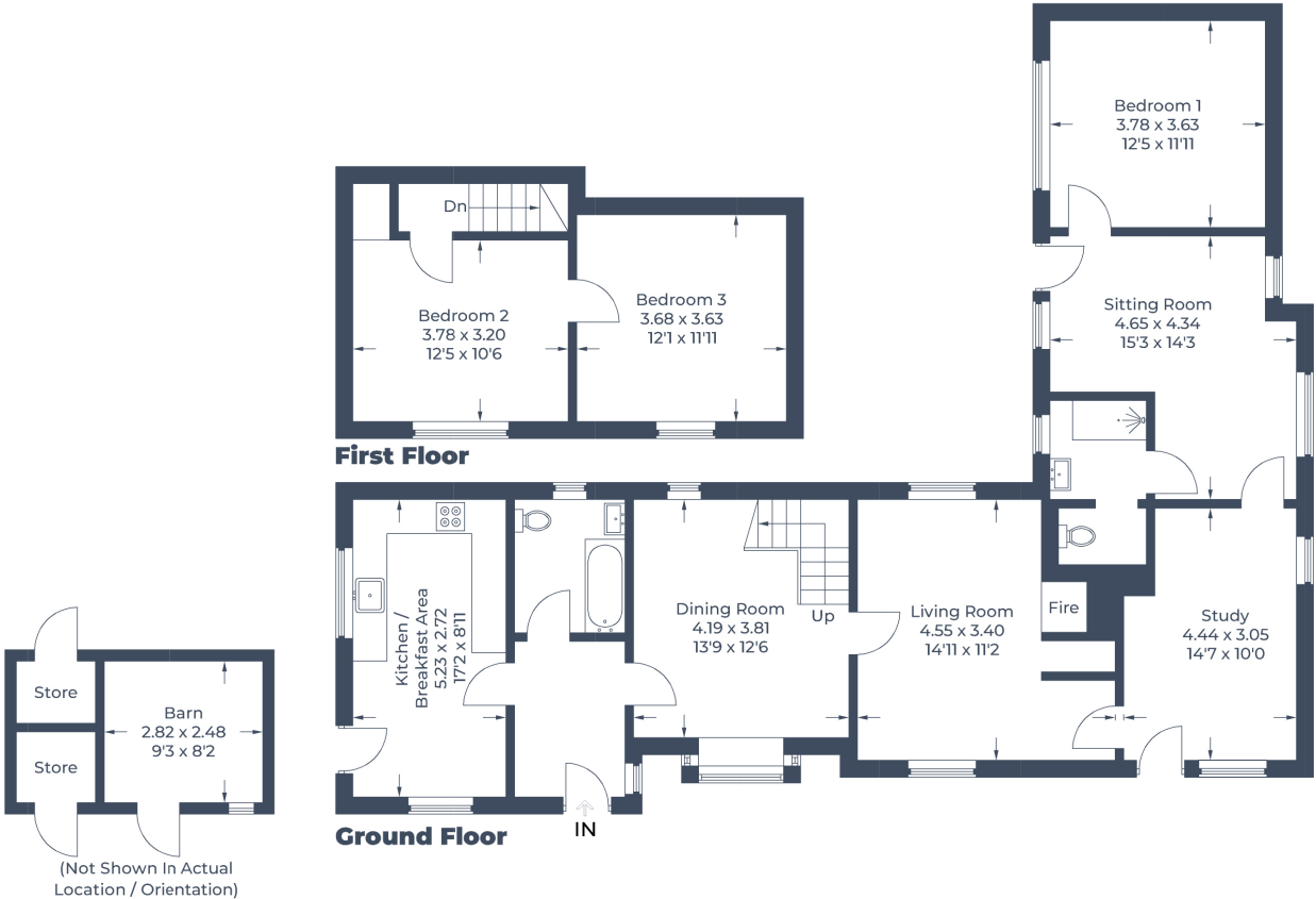
Illustration for identification purposes only, measurements are approximate, not to scale. © CJ Property Marketing Produced for Country Properties

Approximate Gross Internal Area Ground Floor = 112.4 sq m / 1,210 sq ft First Floor = 30.0 sq m / 323 sq ft Outbuilding = 10.9 sq m / 117 sq ft Total = 153.3 sq m / 1,650 sq ft