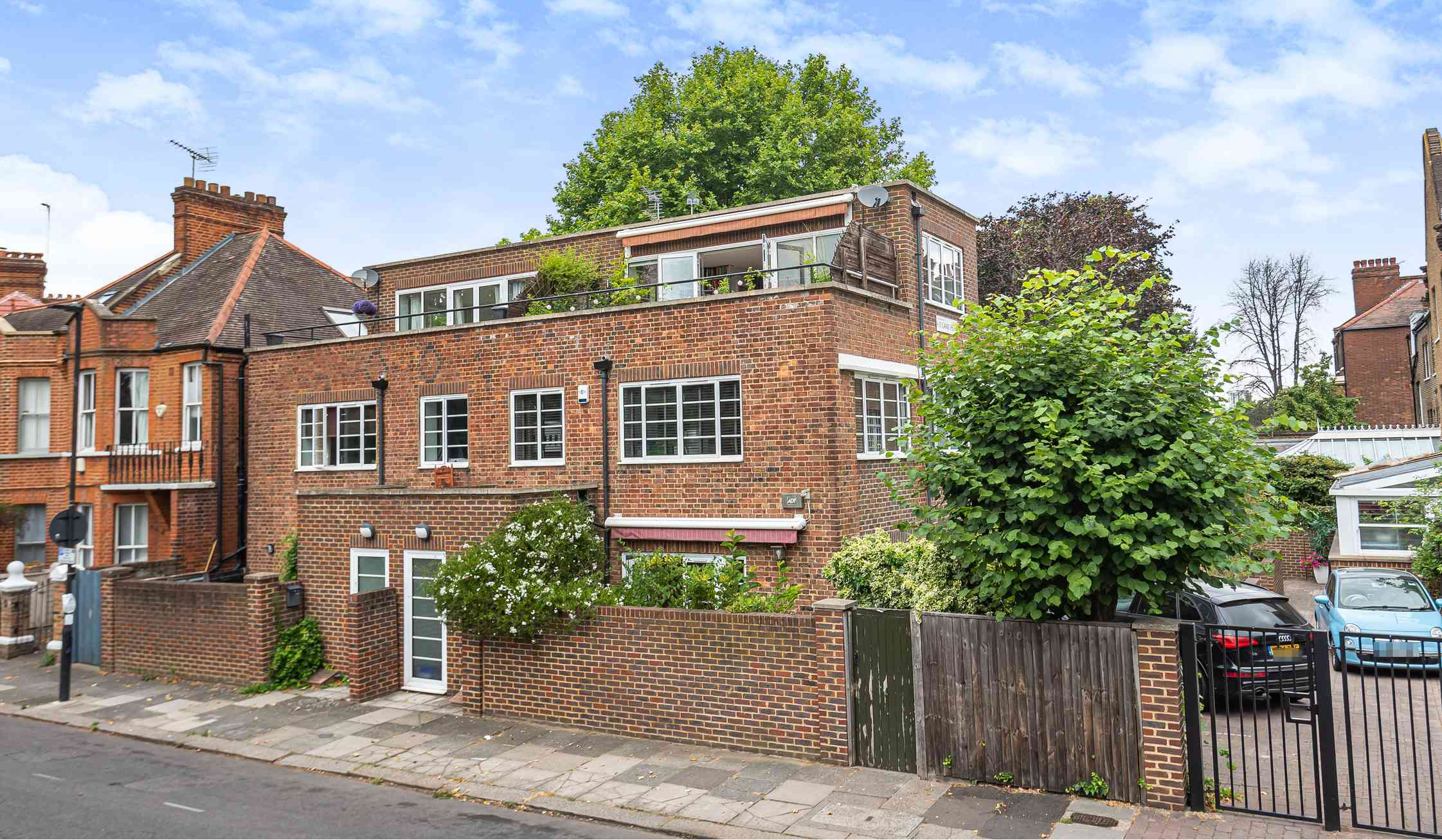
Carre Mews, London, SE5 9LS