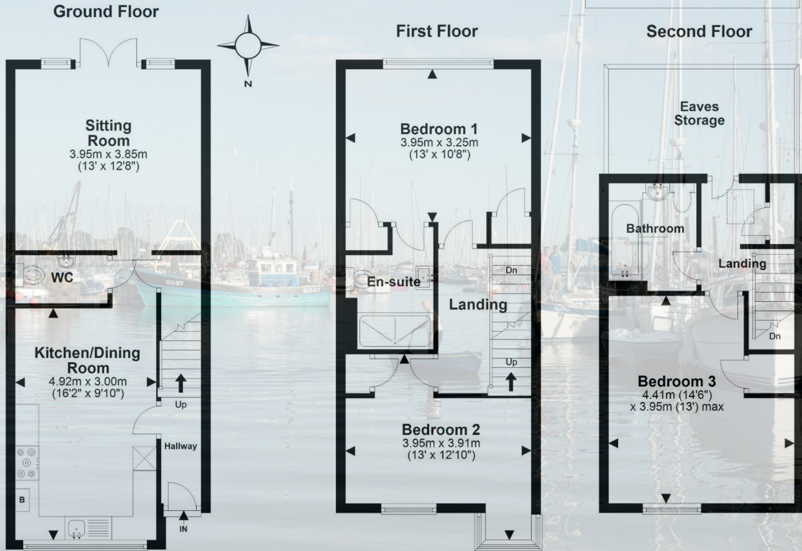
Illustration for identification purposes only; measurements are approximate, not to scale. FP USketch Plan produced using PlanUp.

Approx Gross Internal Area 102.7 sqm / 1105.2 sqft