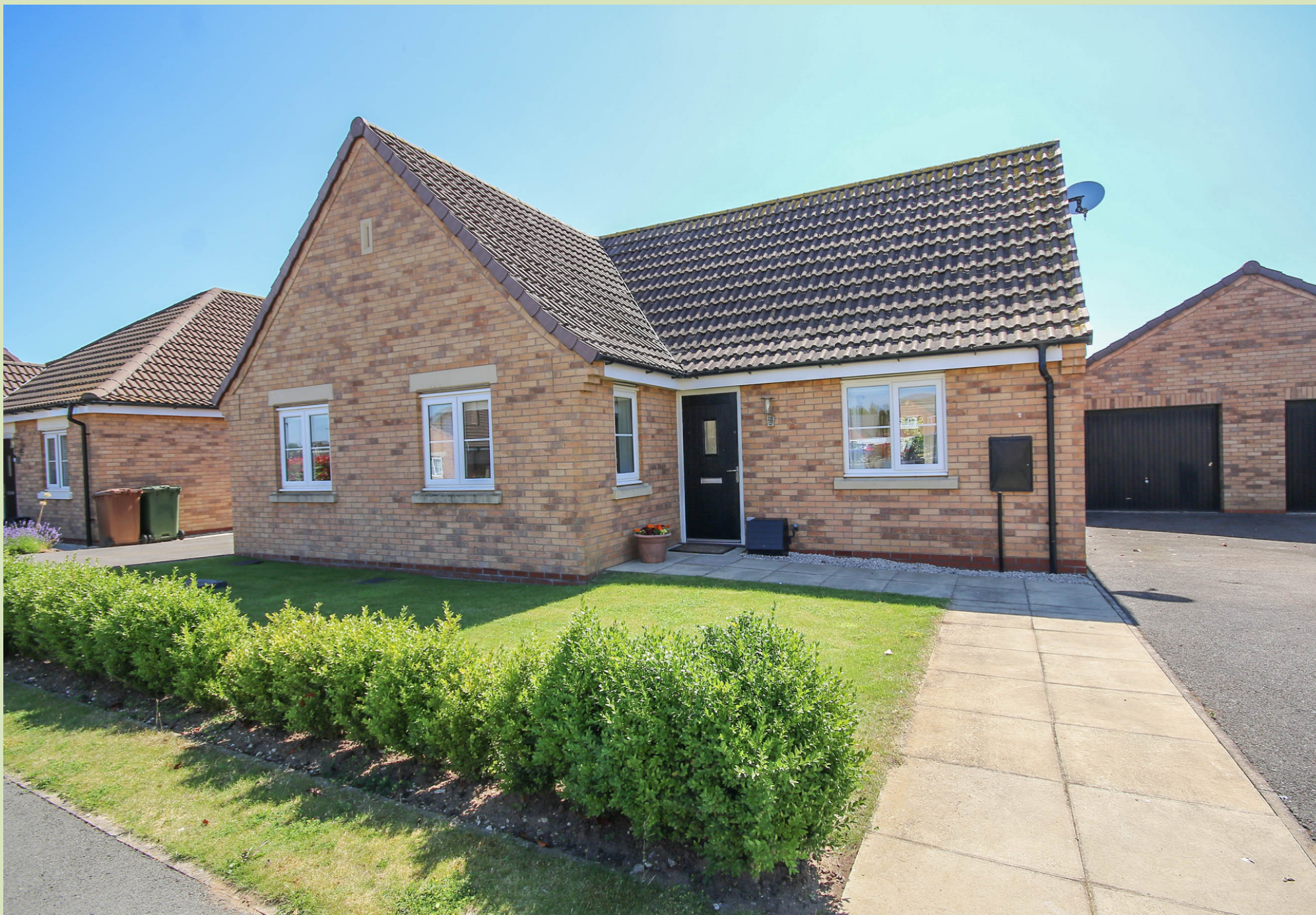
5 Poachers Way, Terrington St Clement Guide Price £325,000