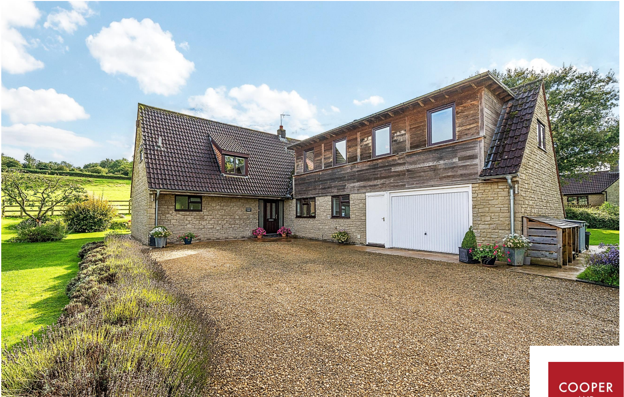
Prospect House, Mells, Frome, BA11 3QN