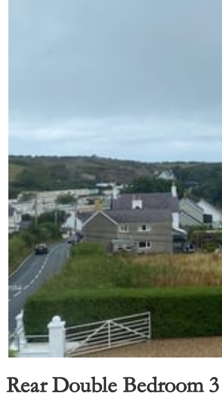
Rear Double Bedroom 3