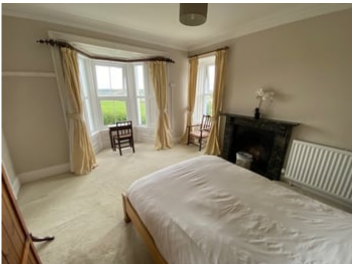
Front Double Bedroom 2

16' 8" x 12' 8" (5.08m x 3.86m) again into Bay window with a lovely aspect and also a side window which has a coastal aspect towards New Quay. A Period cast iron fireplace with painted slate surround and slate hearth, central heating radiator, coving to ceiling.