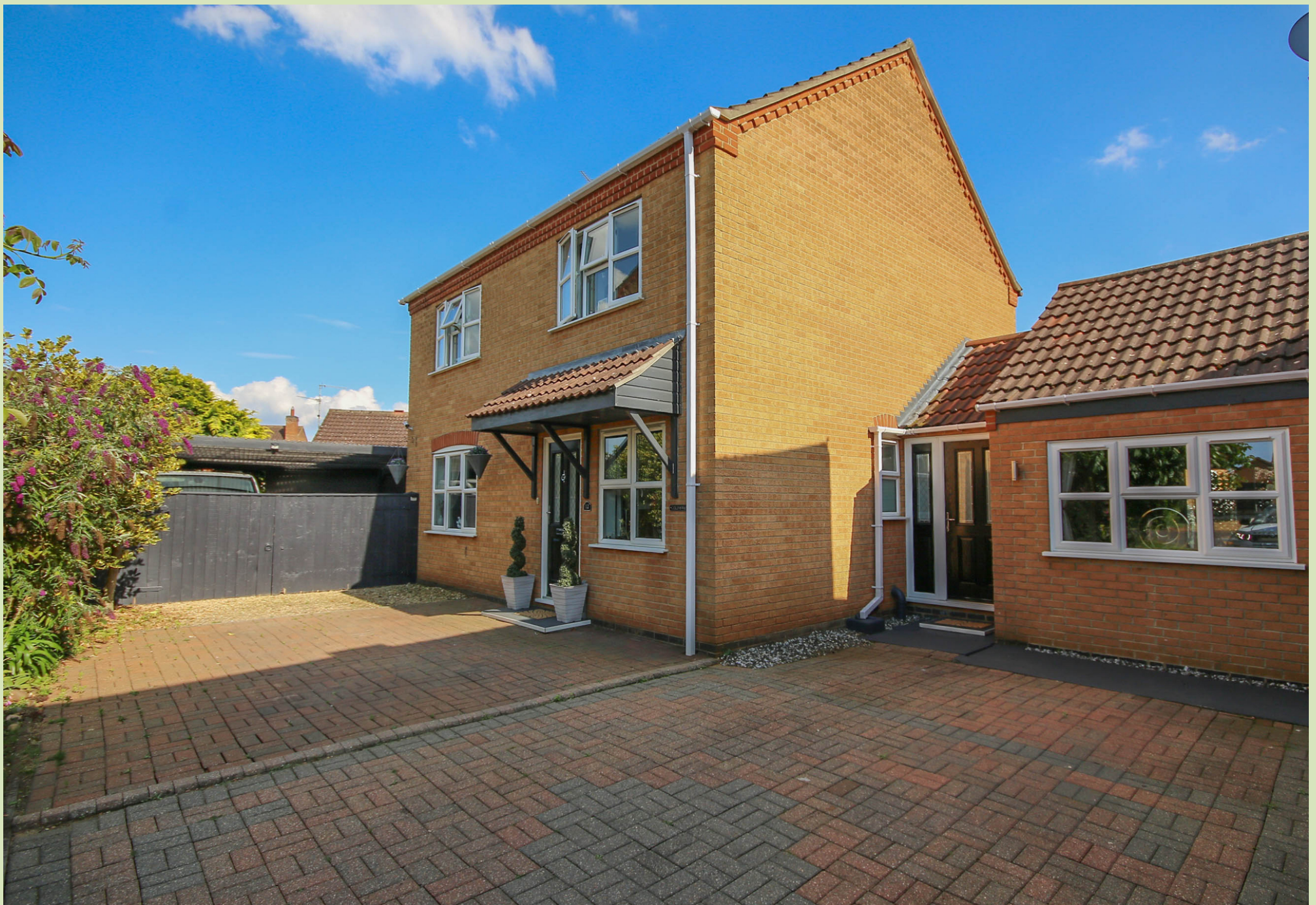
12 Shouldham Close, Dersingham Guide Price £425,000