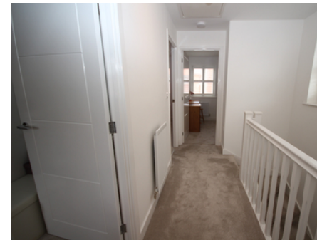
21 Sander Close, Stotfold, Hitchin, Hertfordshire, SG5 4SZ