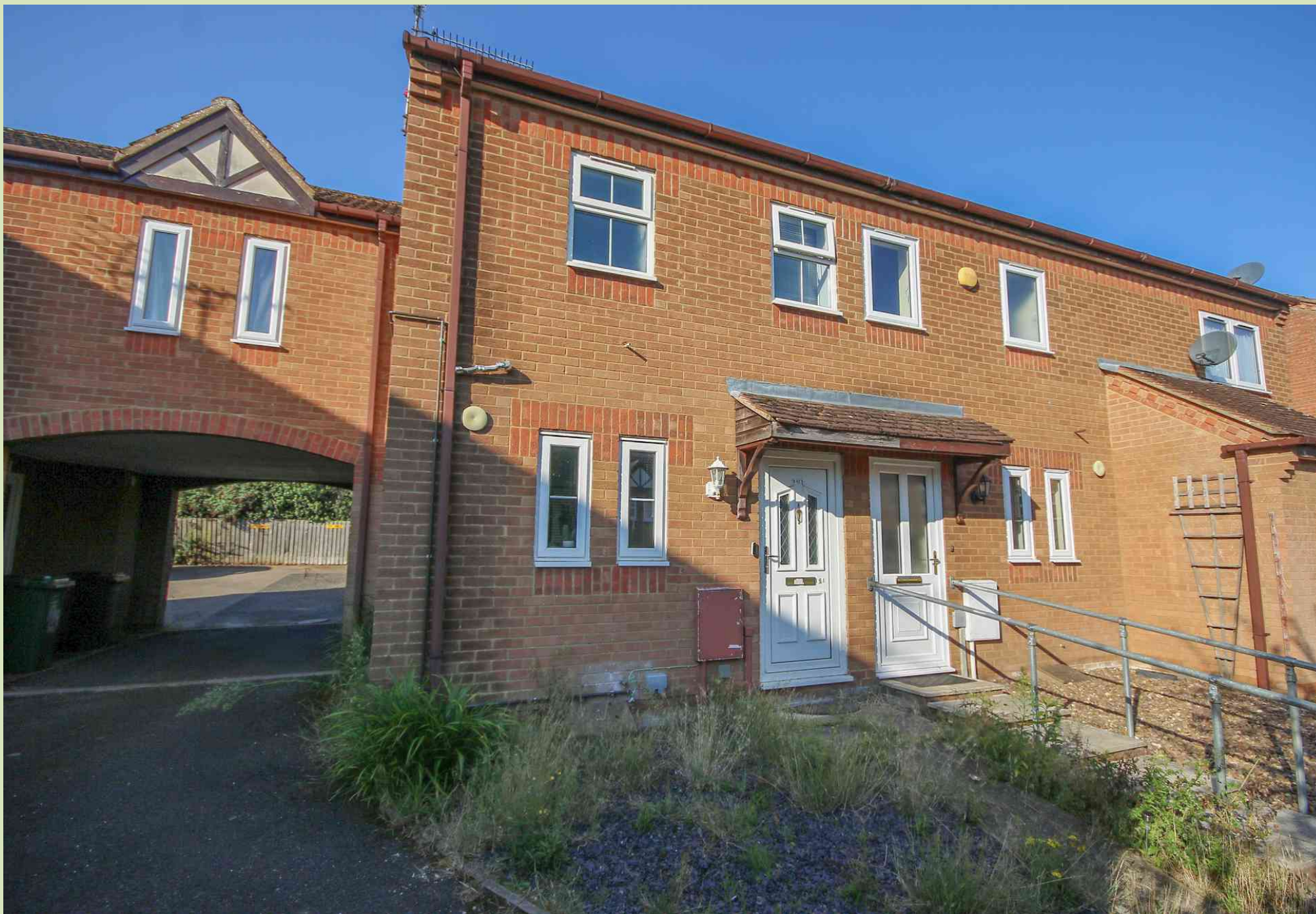
191 Elvington, King's Lynn Guide Price £170,000