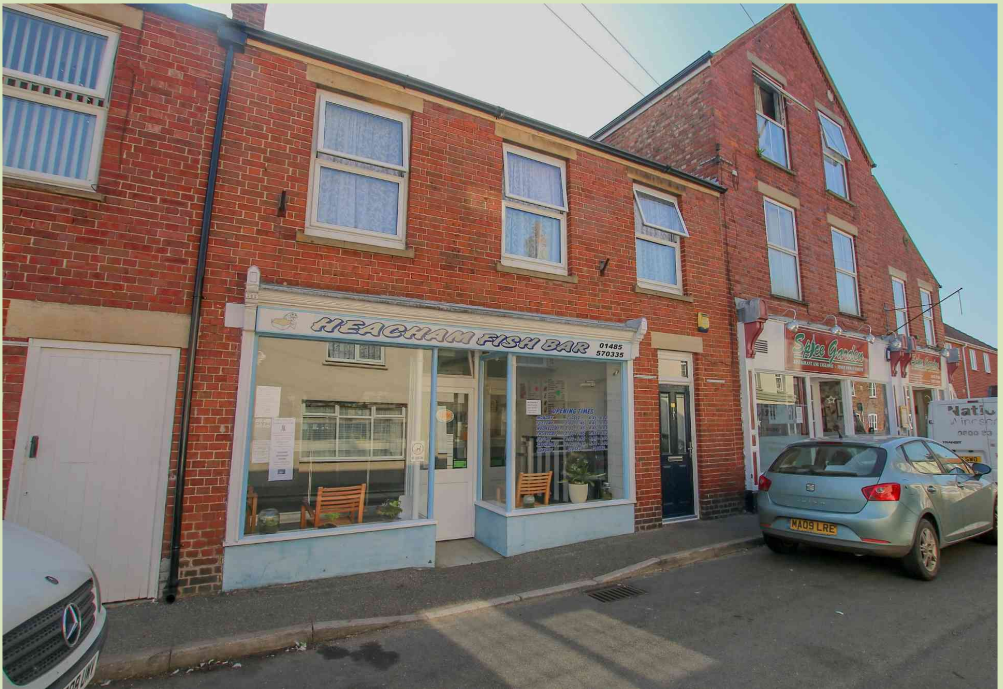
Heacham Fish Bar, Heacham Guide Price £475,000