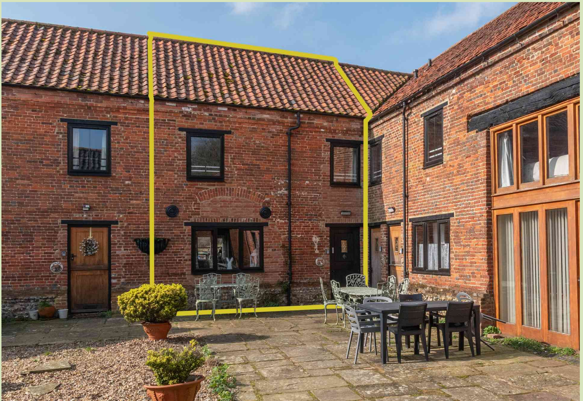
North Barn, Cannister Hall, Toftrees Guide Price £285,000