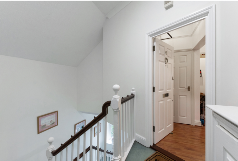
TOP FLOOR 587 sq.ft. (54.5 sq.m.) approx.