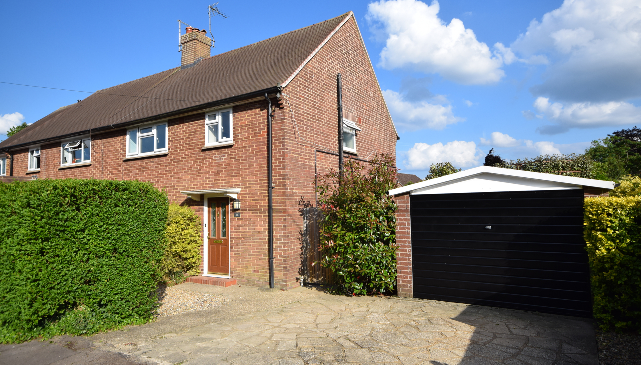
46 Babs Field, Bentley, Farnham, Hampshire. GU10 5LS. Guide Price £535,000