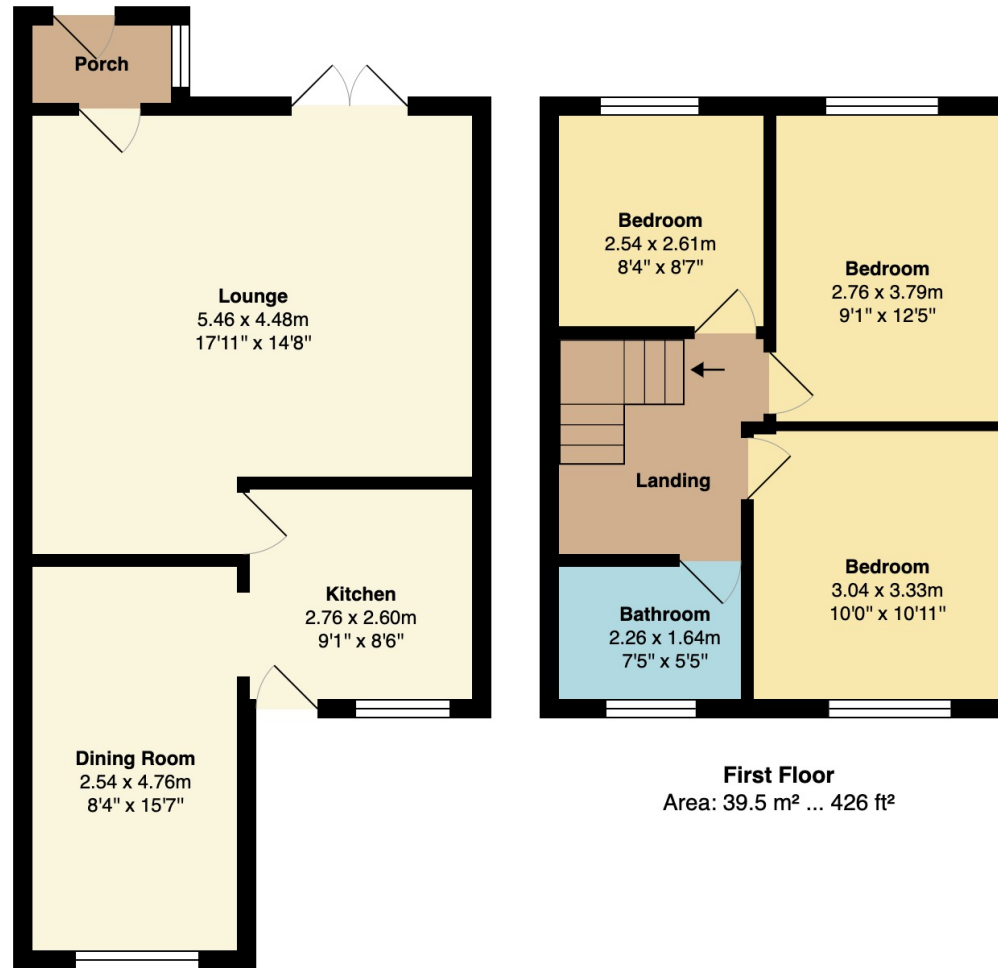
Ground Floor Area: 49.4 m 2 ... 532 ft 2