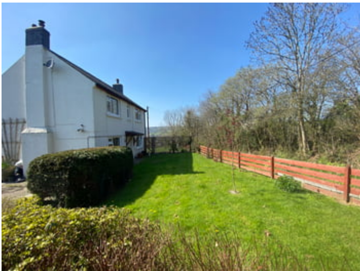
GARDEN (THIRD IMAGE)