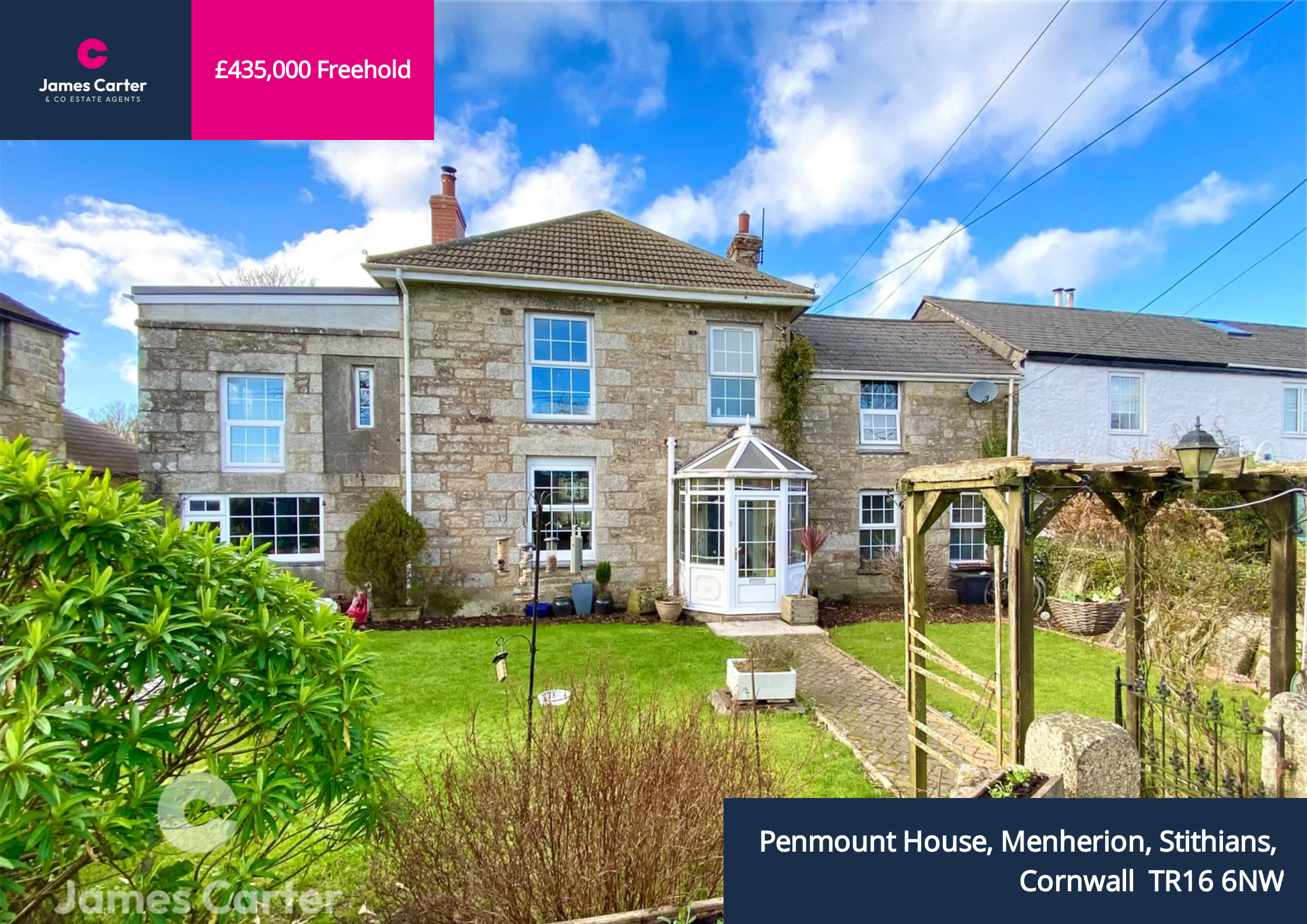
Penmount House, Menherion, Stithians, Cornwall TR16 6NW