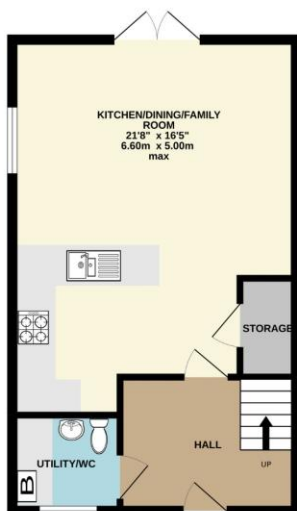
GROUND FLOOR 446 sq.ft. (41.4 sq.m.) approx.