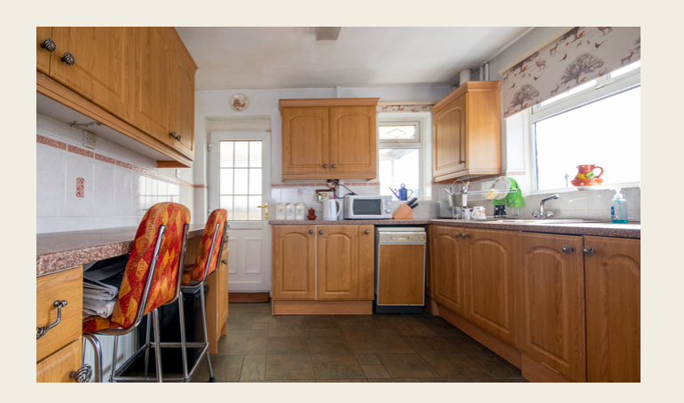
tiling, radiator, ceiling light point and an opaque double glazed UPVC window to side.

having tile effect flooring, suite comprising panelled bath with electric shower over and full height tiled splashback, pedestal wash hand basin and W.C., half height