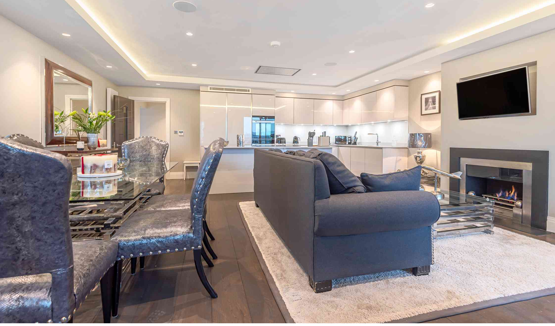
Ranelagh Gardens, London, SW6 3UJ