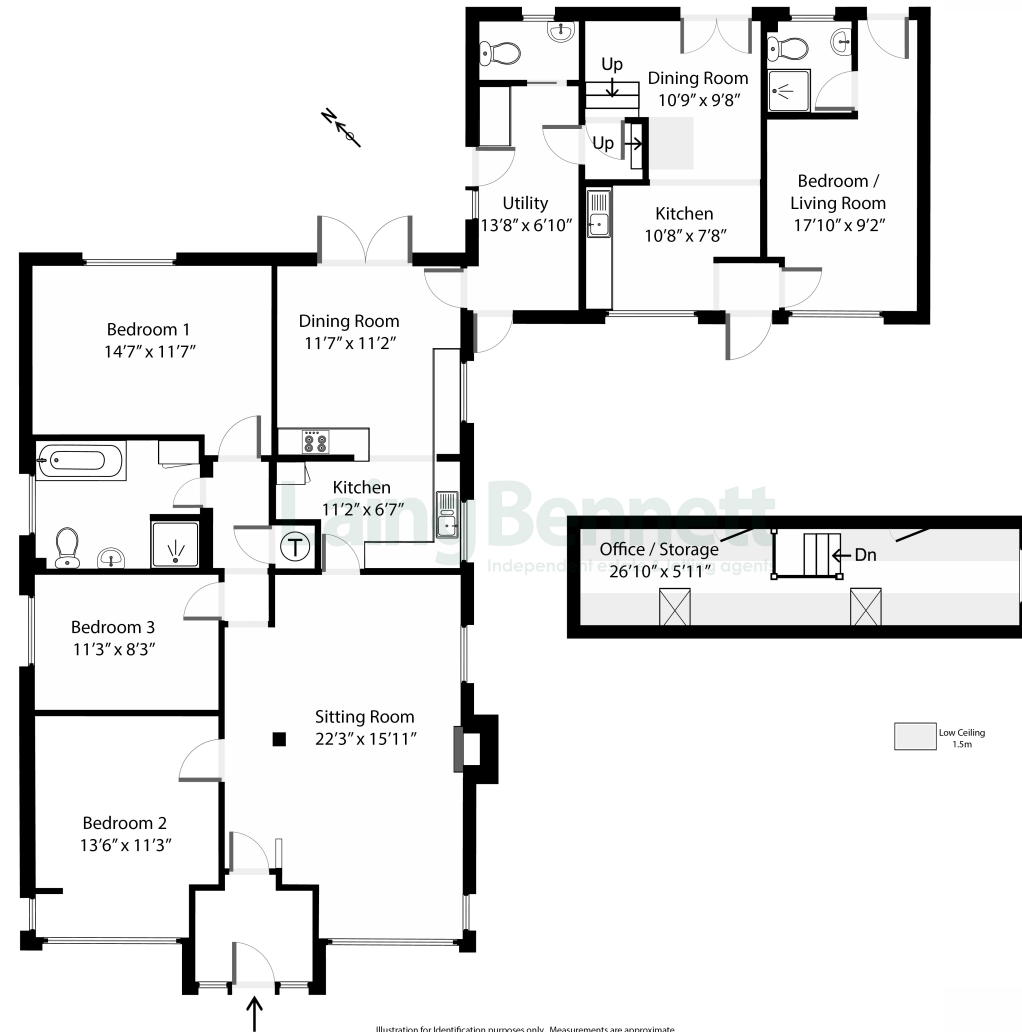
Illustration for identification purposes only. Measurements are approximate. Not to scale. Outbuildings are not shown in actual location.

Approximate Gross Internal Area = 160 sq m / 1726 sq ft