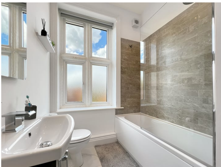
8' 11" x 6' 5" (2.72m x 1.96m)