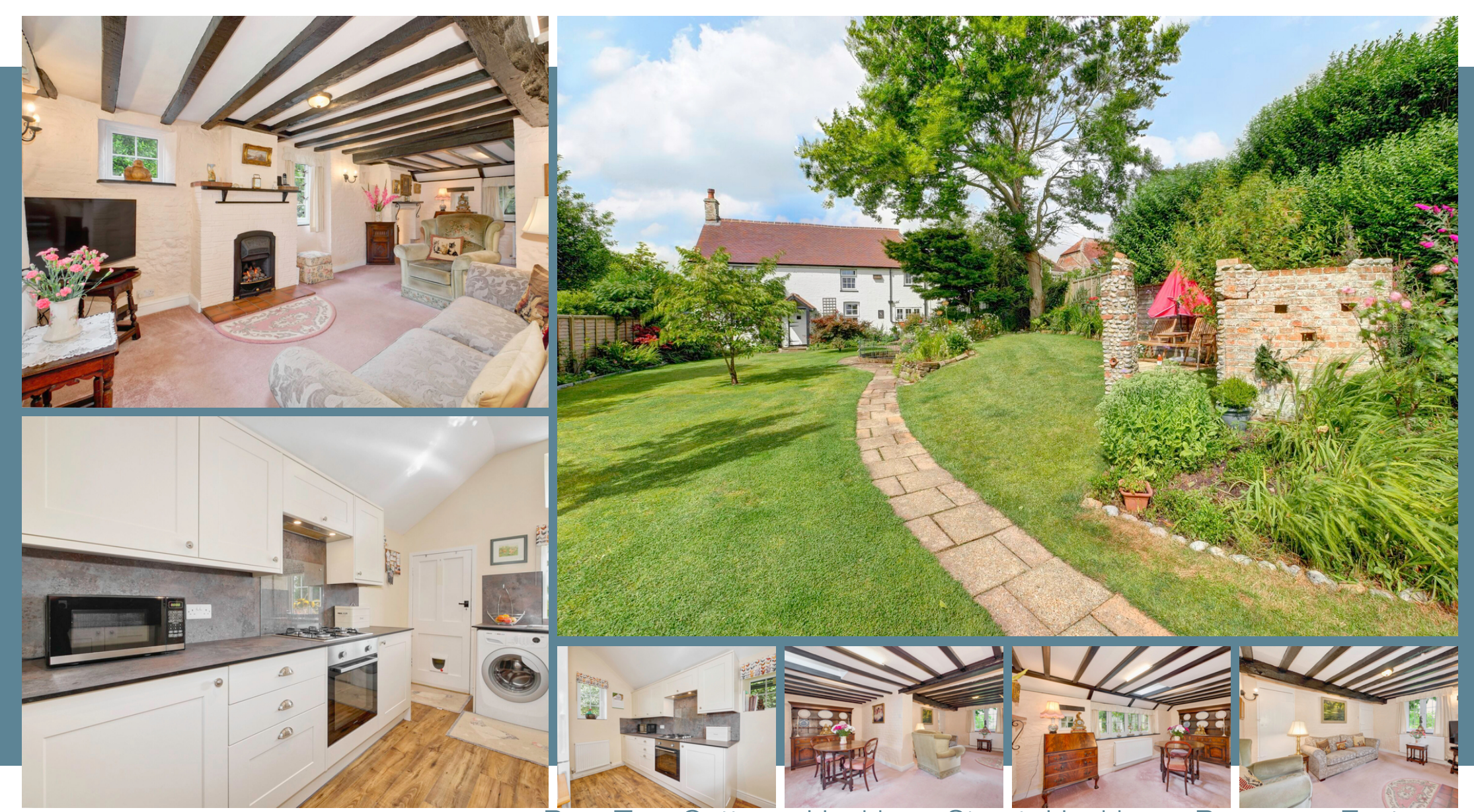
Pear Tree Cottage, Hankham Street, Hankham, Pevensey, East Sussex BN24 5BG