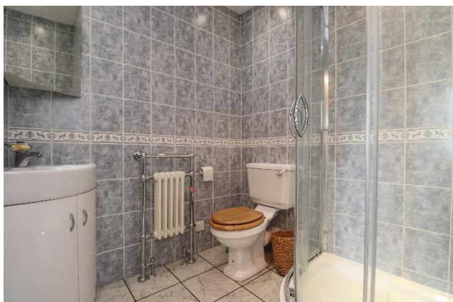
EN-SUITE TO BEDROOM 2

EN-SUITE SHOWER ROOM (5'10 x 5'9) Three piece suite comprising of shower cubicle with waterfall shower head, vanity unit wash hand basin and WC. Tiled walls, panelled ceiling with spotlights, tile effect flooring and cast radiator.