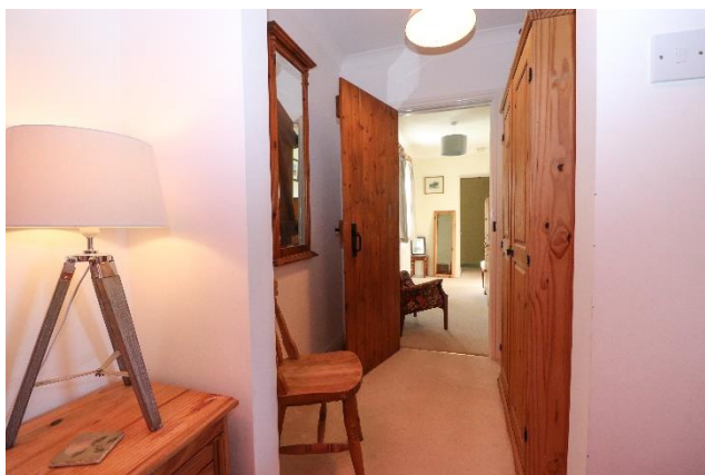
SEPARATE DESSING AREA

OUTSIDE The front of the property has a lawned garden with a ground level oil tank and driveway parking for several vehicles alongwith storage shed/log store. To the rear of the property is a patio seating area bordered by hedgerow, a well established lawned garden with a pretty garden pond surrounded by mature trees and plants, raised flower beds and external water supply.