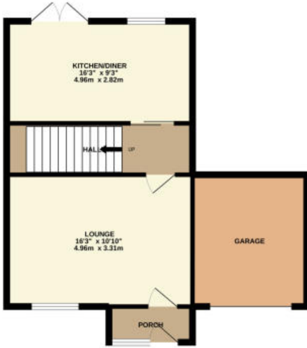
GROUND FLOOR 537 sq.ft. (49.9 sq.m.) approx.